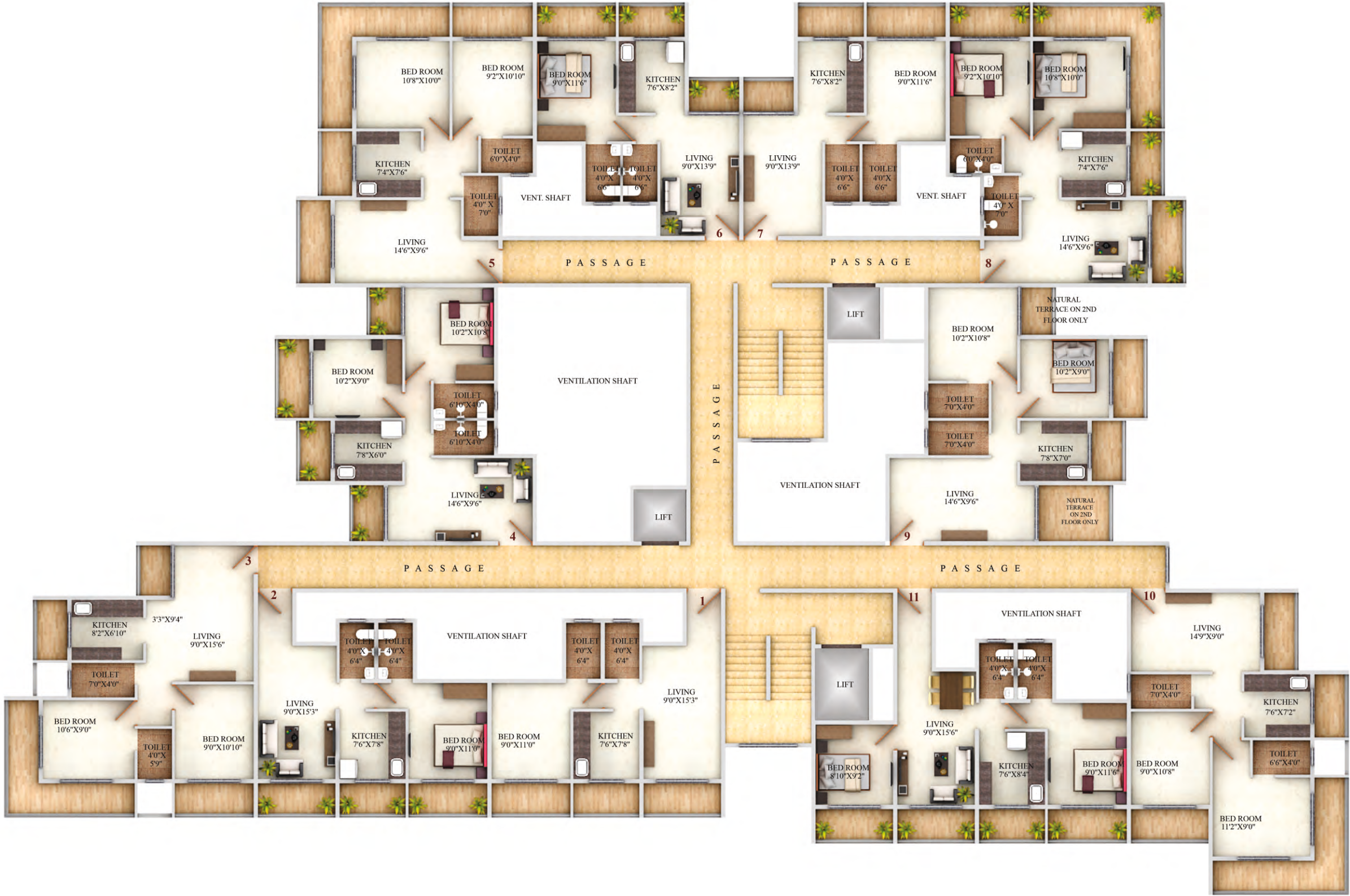
3RD TO 7TH & 9TH TO 12TH FLOOR PLAN